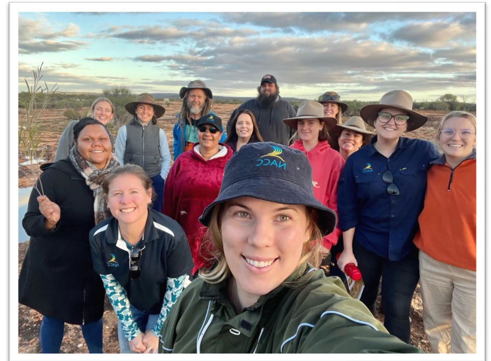
The NACC NRM 2022 team retreat, Mt Gibson