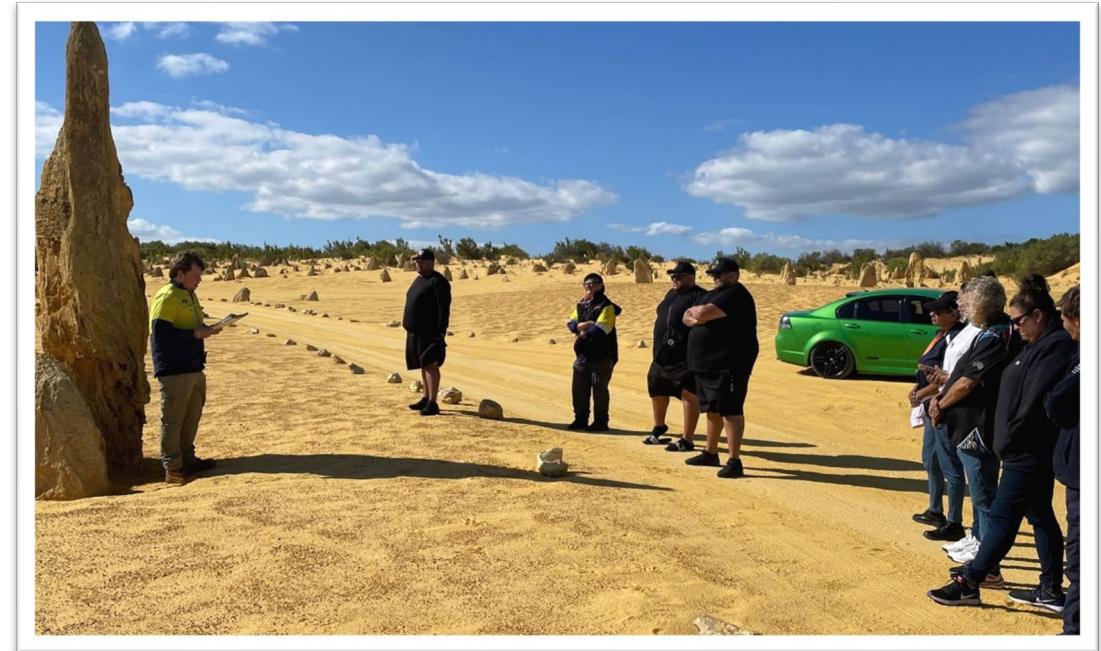
MARP Regional Meeting, Nambung National Park

Three NACC NRM projects incorporating TEK