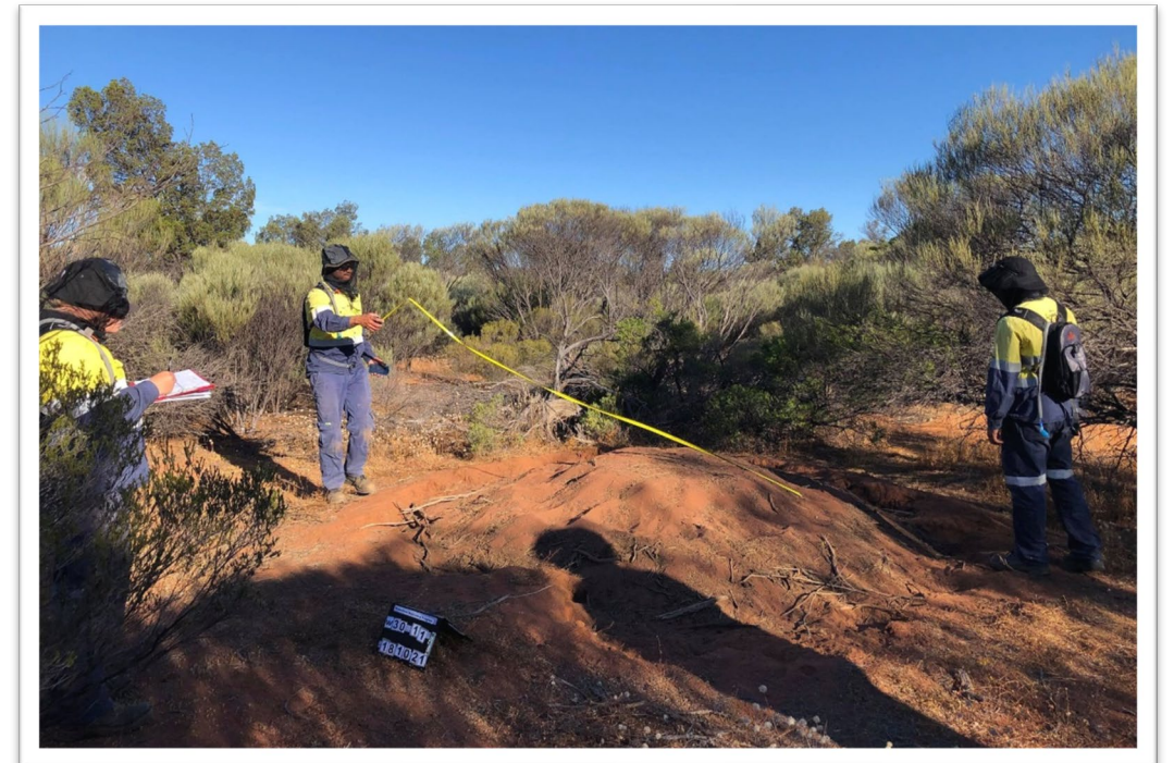
Malleefowl Monitoring, Badja Station