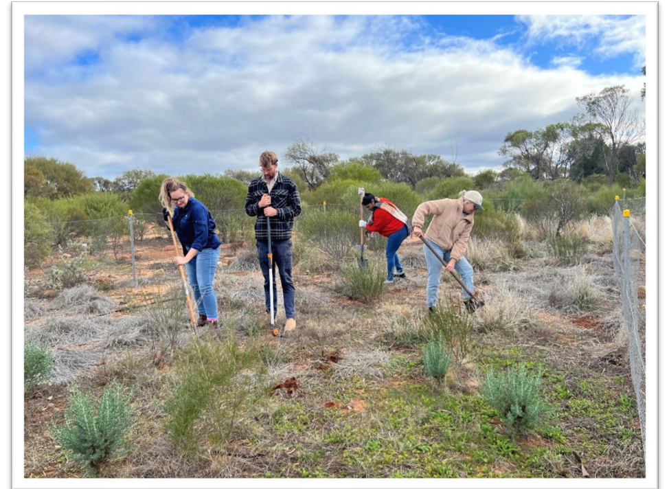
NACC NRM staff helping out at the AWC's Mt Gibson Sanctuary as part of the 2022 NACC NRM Team Retreat