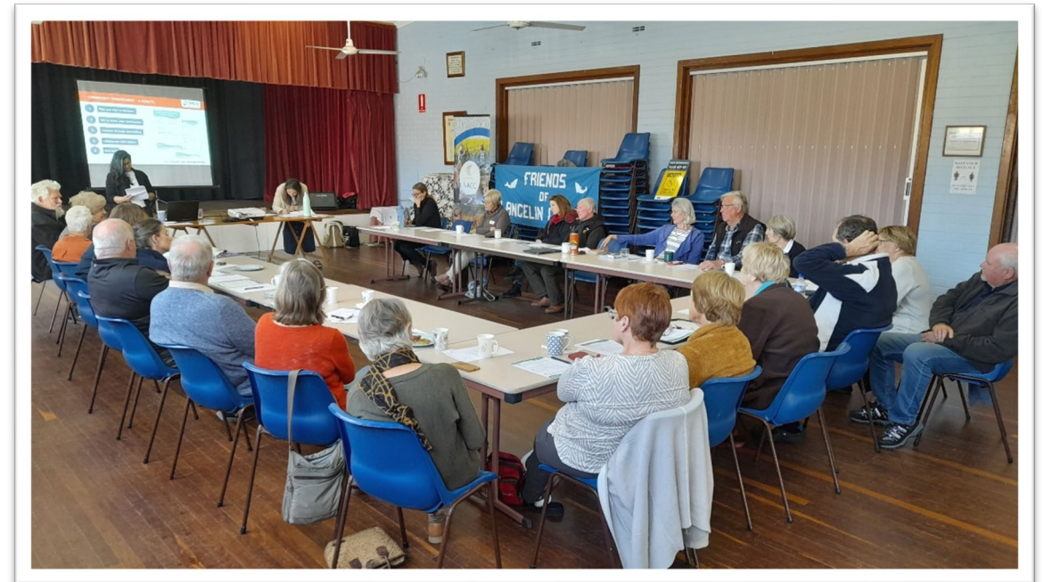
2022 Coastcare Forum, Lancelin