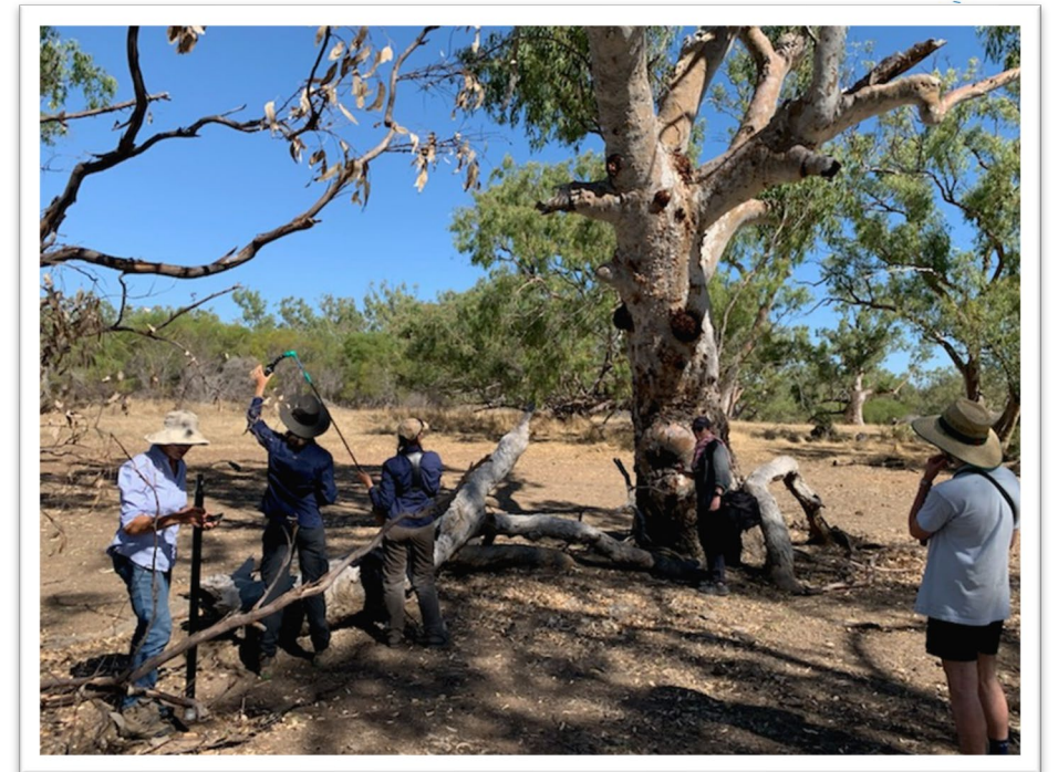
Carnaby Cockatoo monitoring, Murchison House Station