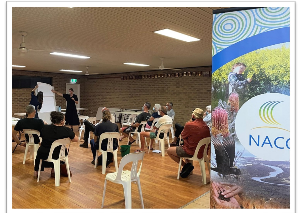
Chapman River Estuary Management Plan consultation session