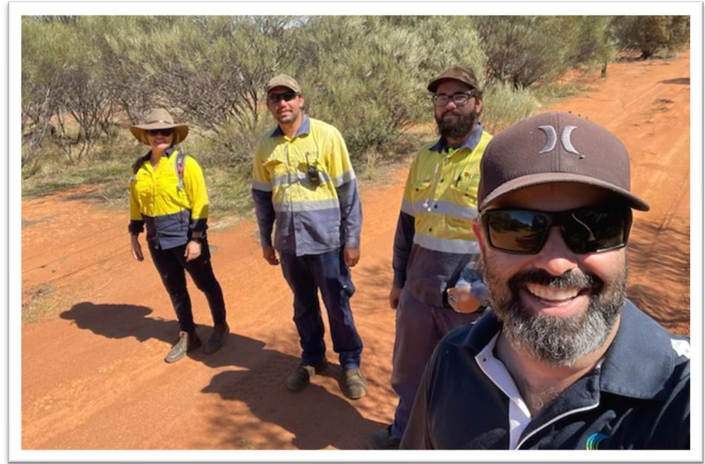
Malleefowl Monitoring, Badja Station

8 projects, delivering 20,000 ha of on-farm best practice management activities.