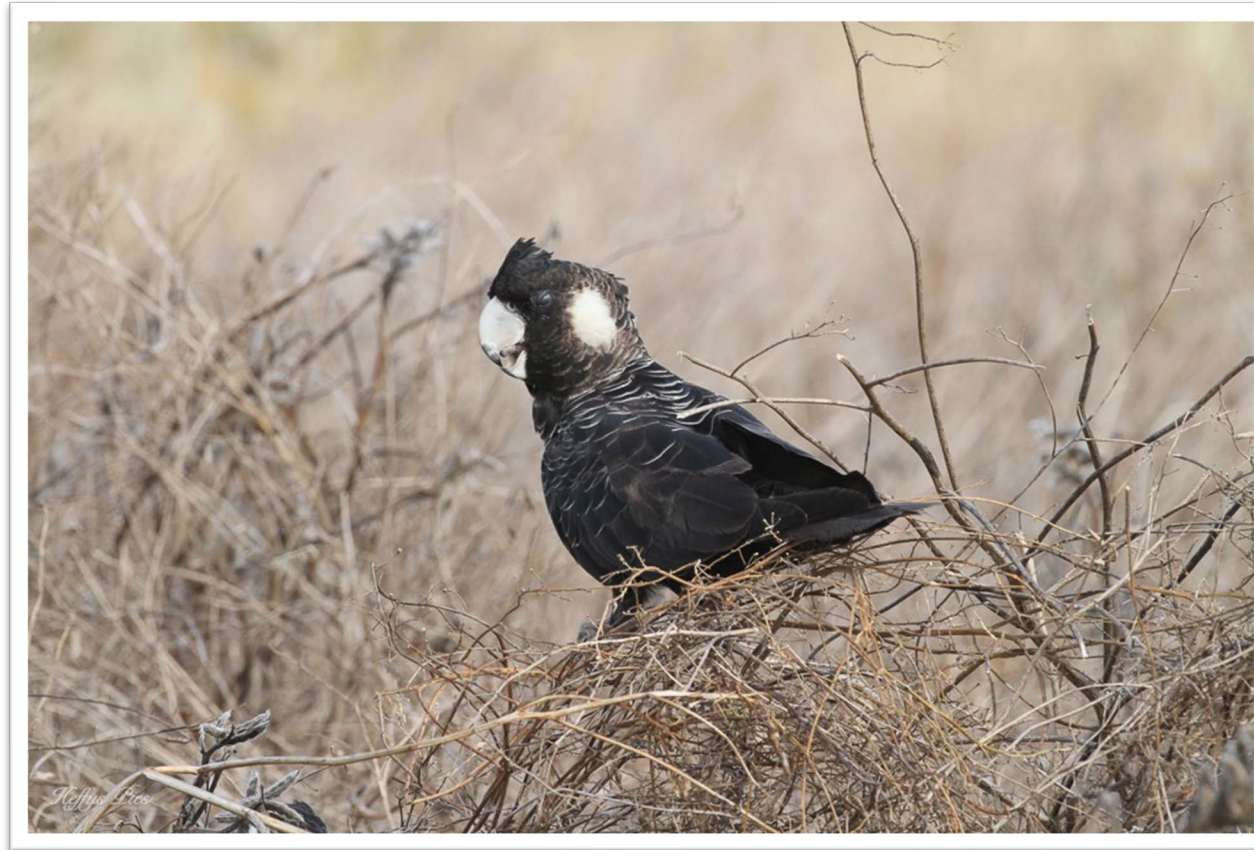
Carnaby Cockatoo