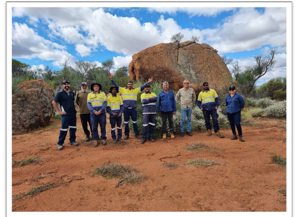
Malleefowl Conservation Works, Ninghan Station Indigenous Protected Area