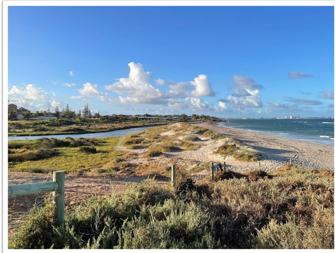
Where the Chapman River Estuary meets the sea