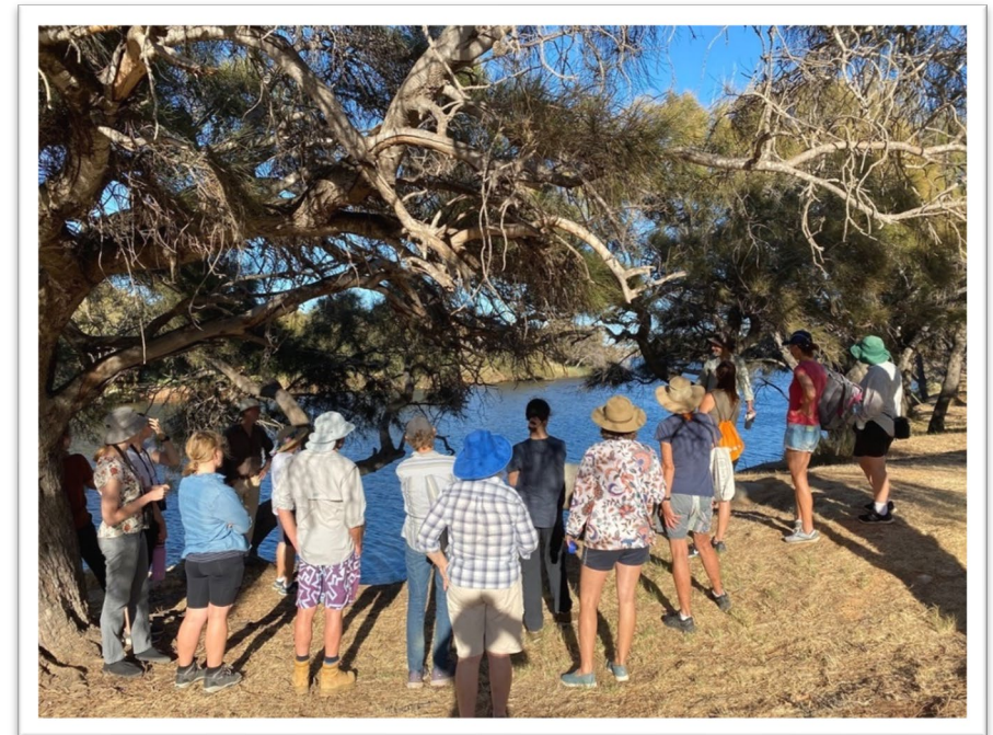
World Wetlands Day community walk, Chapman River Estuary