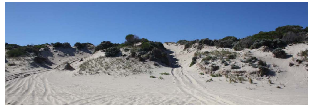
Pic 1: First blowout showing significant degradation by off road vehicles