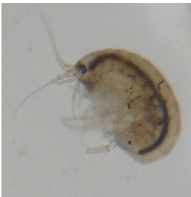
Left: Amphipod from Glenowie, taken on the day with an iscope stand and ipad

George Grey's Journal – with early accounts of Aboriginal settlement and agriculture