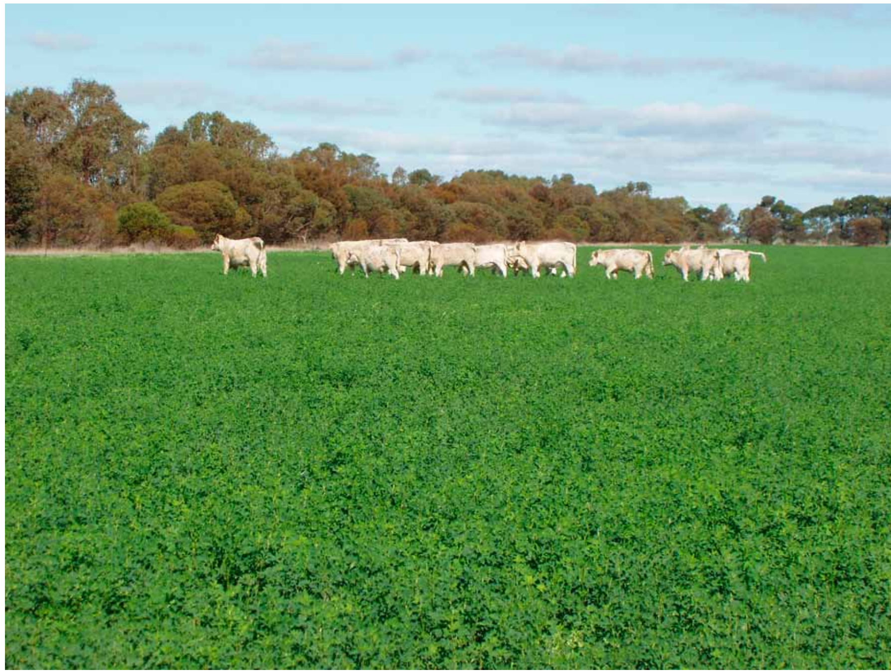
Animal productivity increases when they have access to green feed over summer and autumn