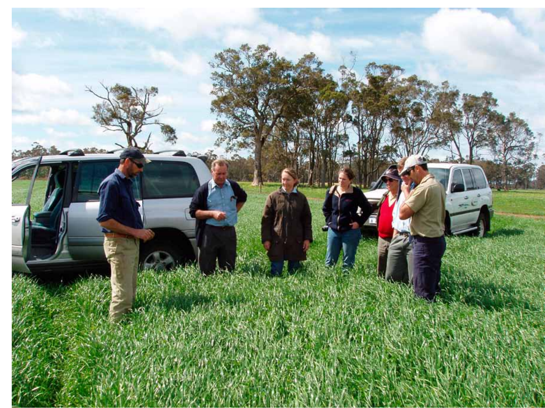
Up to their knees in grass at an Evergreen Field Walk!