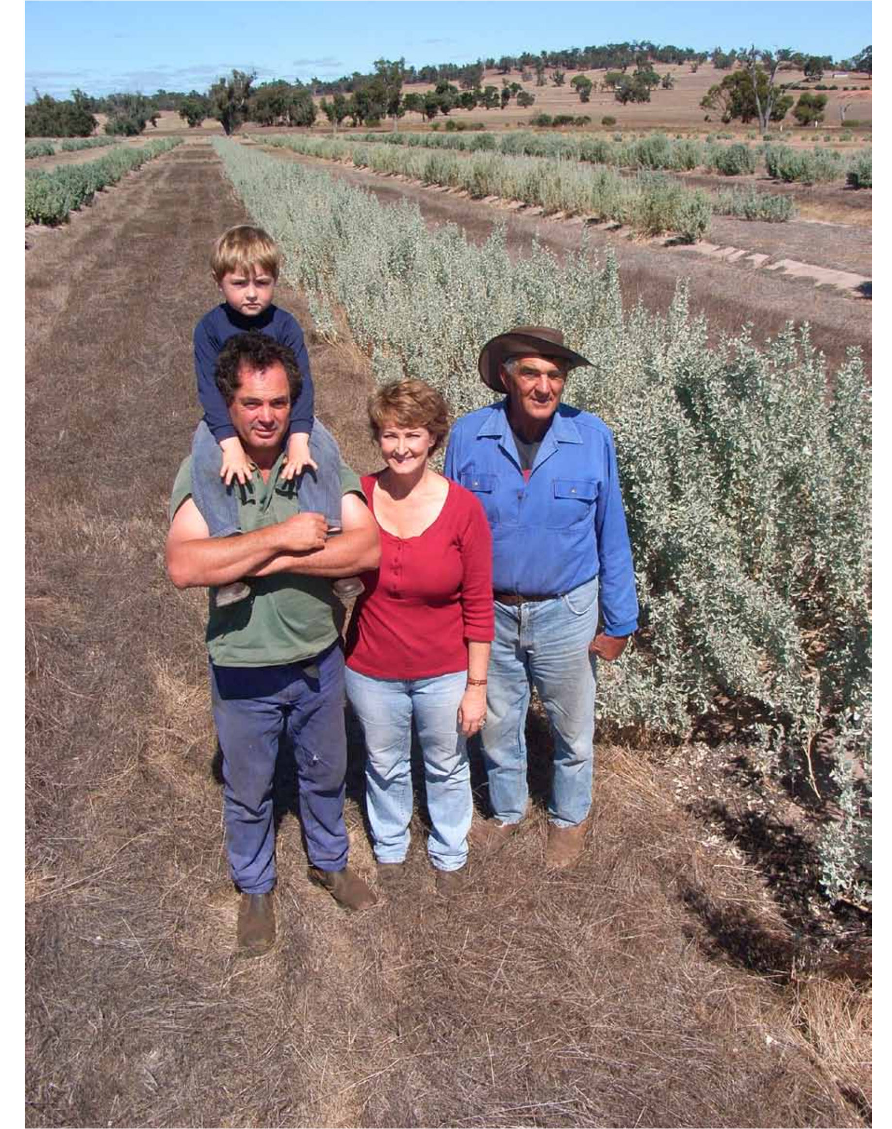
At home among the saltbush