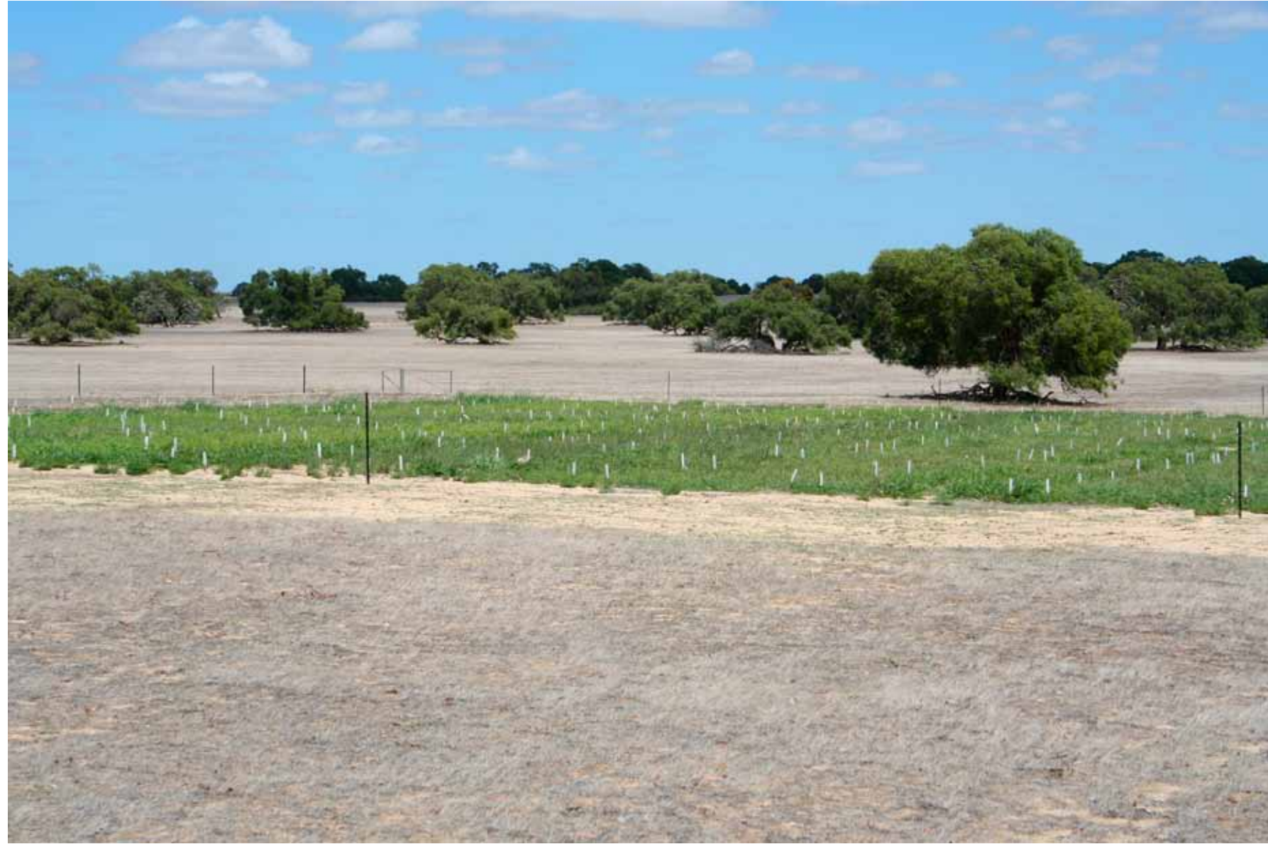
Summer rainfall is never a curse with perennial pastures!

This project brings together three leading perennial pasture farmer organisations in Western Australia . It provides for integrated and comprehensive advice and demonstration of perennial fodder systems for community and Natural Resource Management benefits.