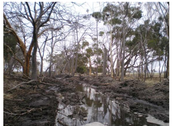
Earthworks are underway to restore the original flow regime. Water is flowing from the area and the next

It is anticipated that restored drainage will flush accumulated salt from the stream. Revegetation in an 18 hectare buffer will increase water use at the site, lowering the water table and improving water and soil quality.