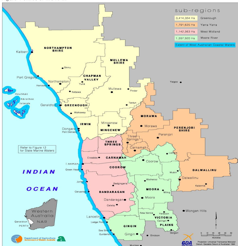
Figure 1 Shires of the NAR

The NACC region lies north of Perth and stretches from Gingin in the south to Kalbarri in the north and from the coast to Kalannie in the east. The NACC region is a rich farming & fishing area, covering 7.5 million hectares. It is characterised by near pristine beaches and offshore islands, coastal sand plain with considerable areas of retained natural vegetation, and a fertile low-rainfall hinterland. The region is also known as a hotspot of biodiversity at both national & global scales. The region has over 30 % of the State’s threatened species within its boundary. Board acre agriculture is the predominant industry accounting for 35% of the regional economy (approx $1 billion per annum). Fishing, mining and tourism also contribute very significantly to our regional economy. However, despite the economic strength and the valuable environmental assets of our region, we are also faced with some of the critical management issues including loss of biodiversity, control of introduced pests, soil quality & production levels, water quality and quantity, and salinity. The region has also been identified as under significant threat from climate change impacts.